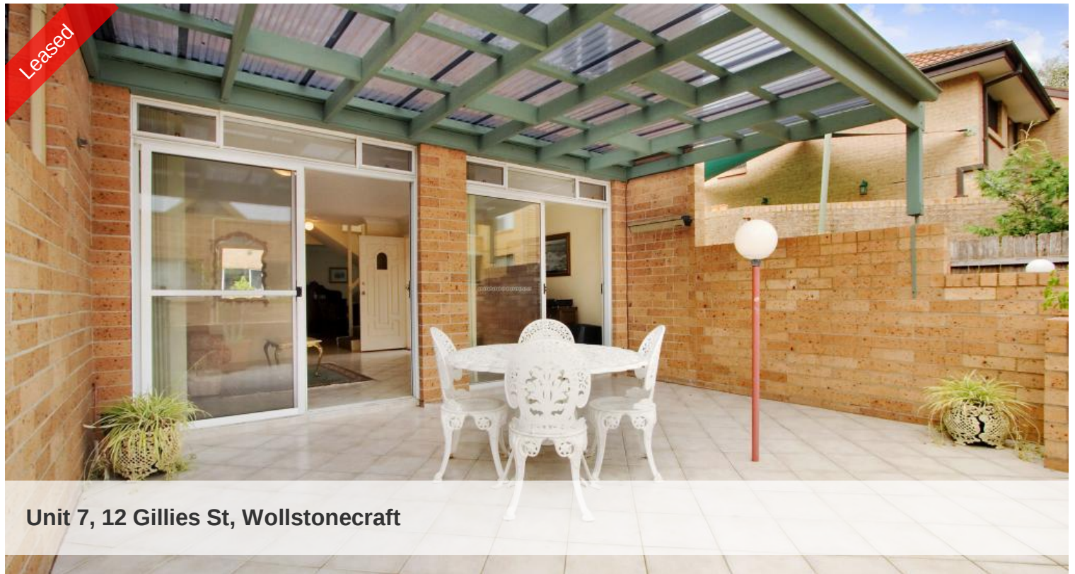
Unit 7, 12 Gillies St, Wollstonecraft