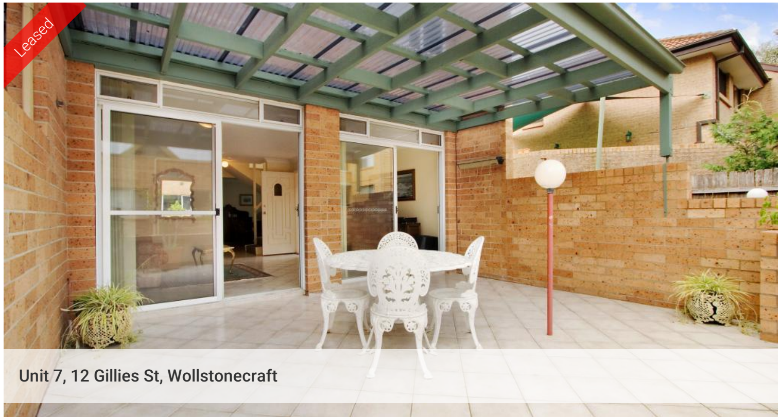
Unit 7, 12 Gillies St, Wollstonecraft