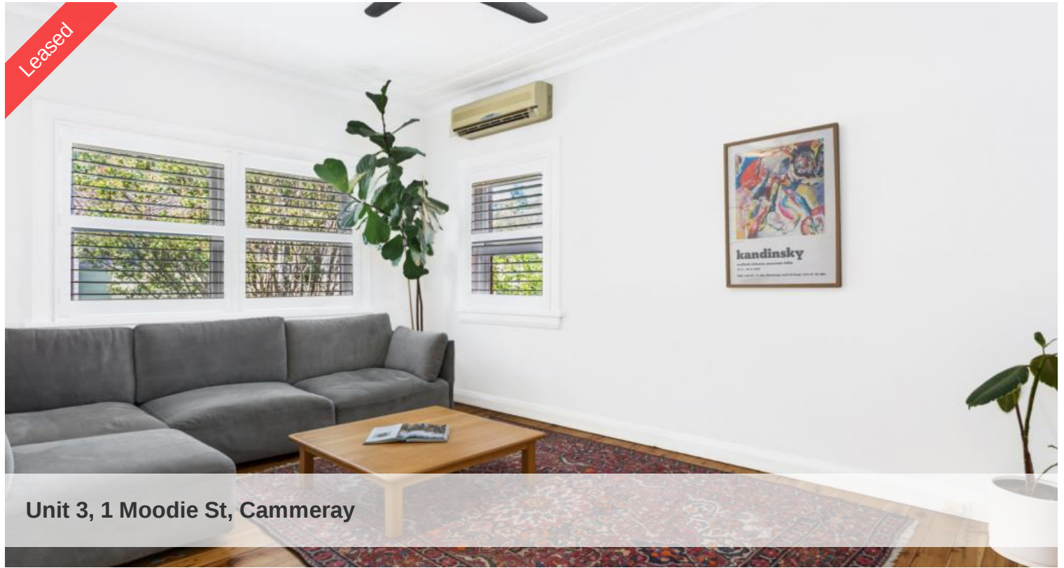
Unit 3, 1 Moodie St, Cammeray