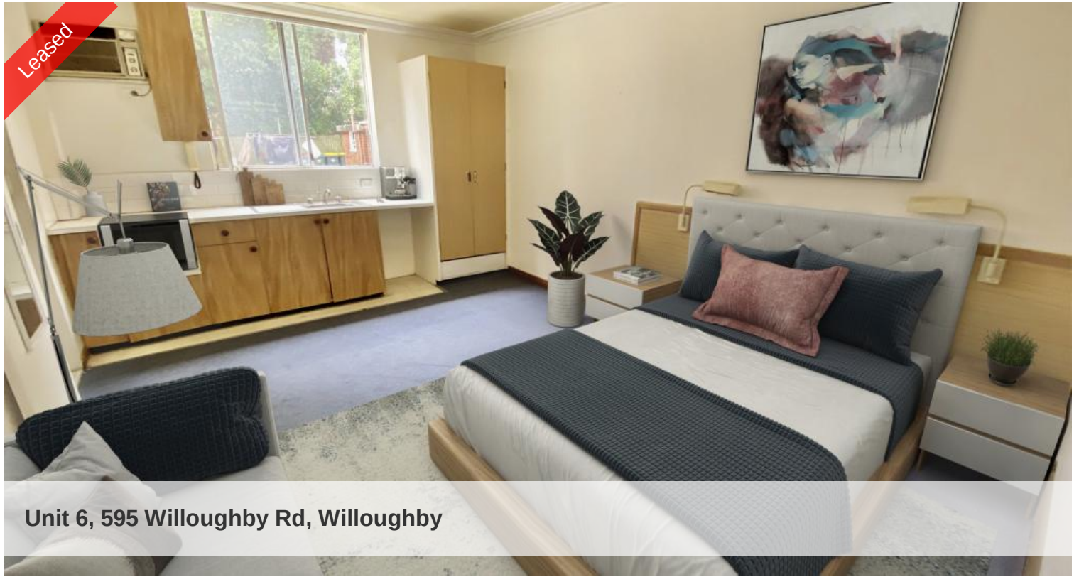
Unit 6, 595 Willoughby Rd, Willoughby