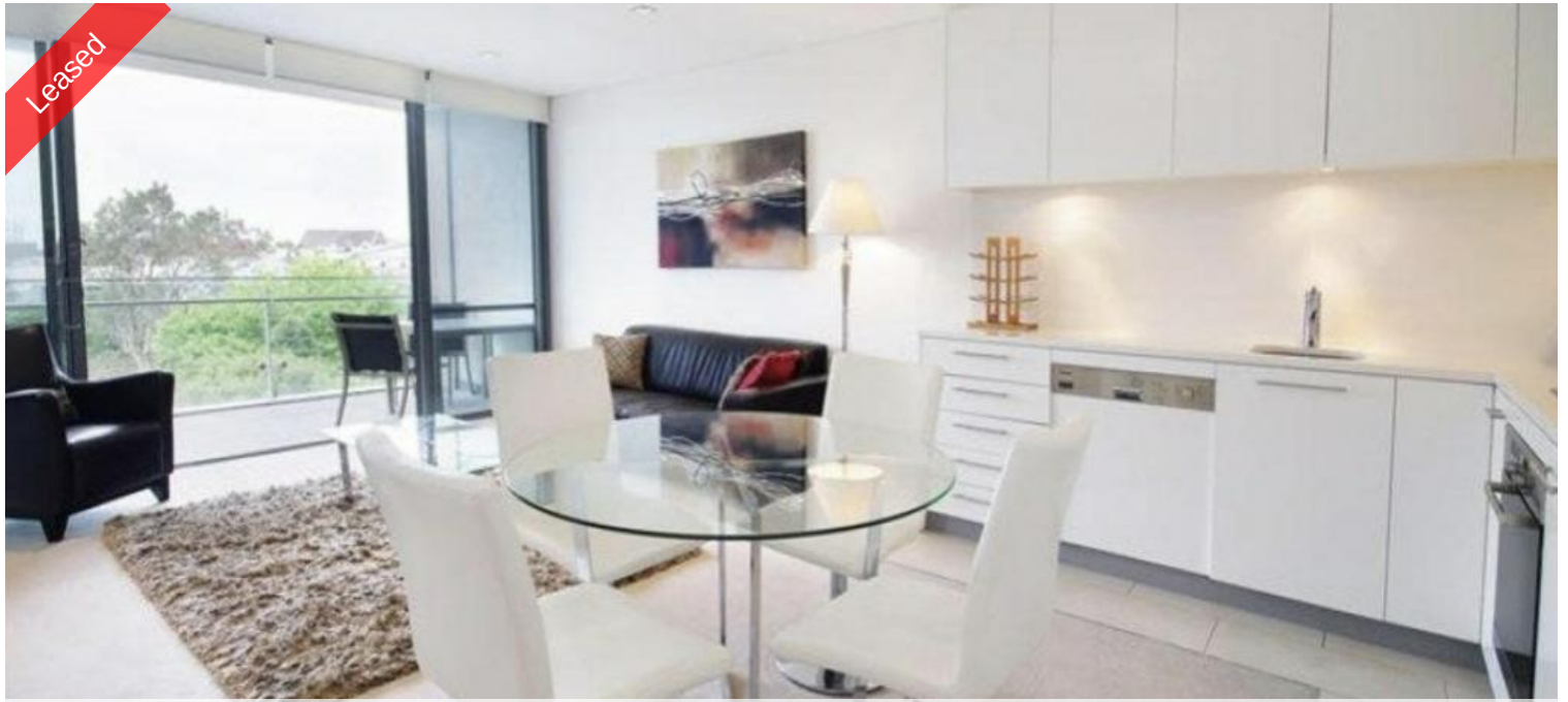
Unit 301, 26 Clarke St, Crows Nest