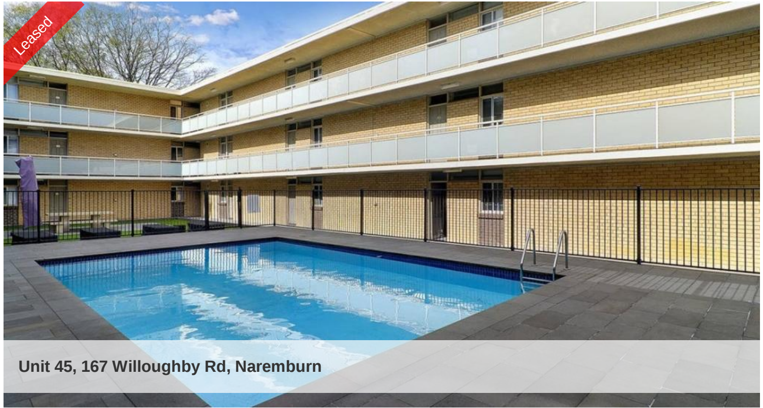
Unit 45, 167 Willoughby Rd, Naremburn