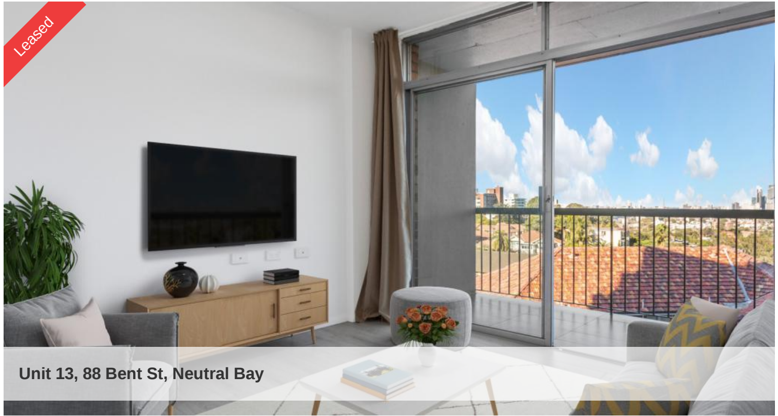
Unit 13, 88 Bent St, Neutral Bay