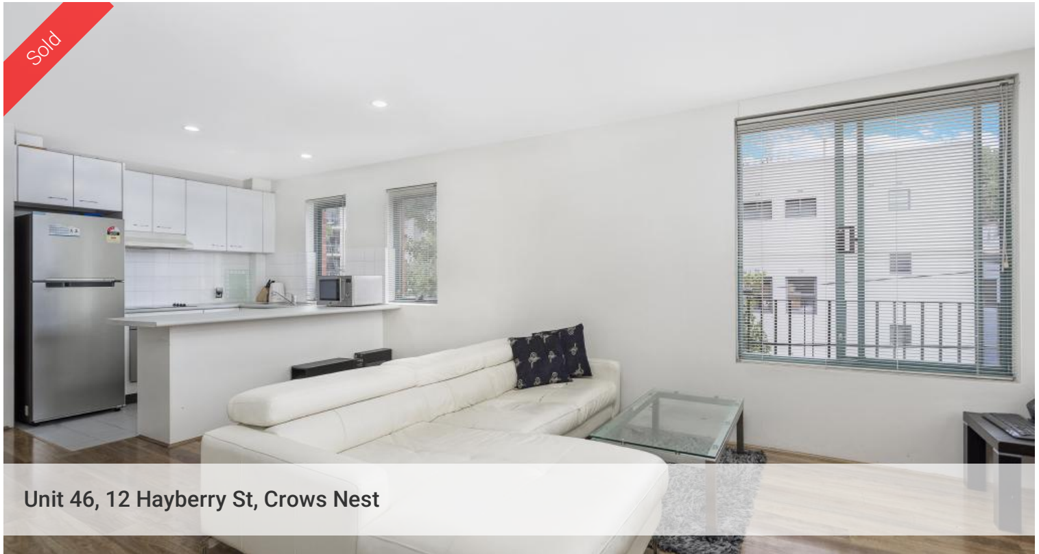
Unit 46, 12 Hayberry St, Crows Nest