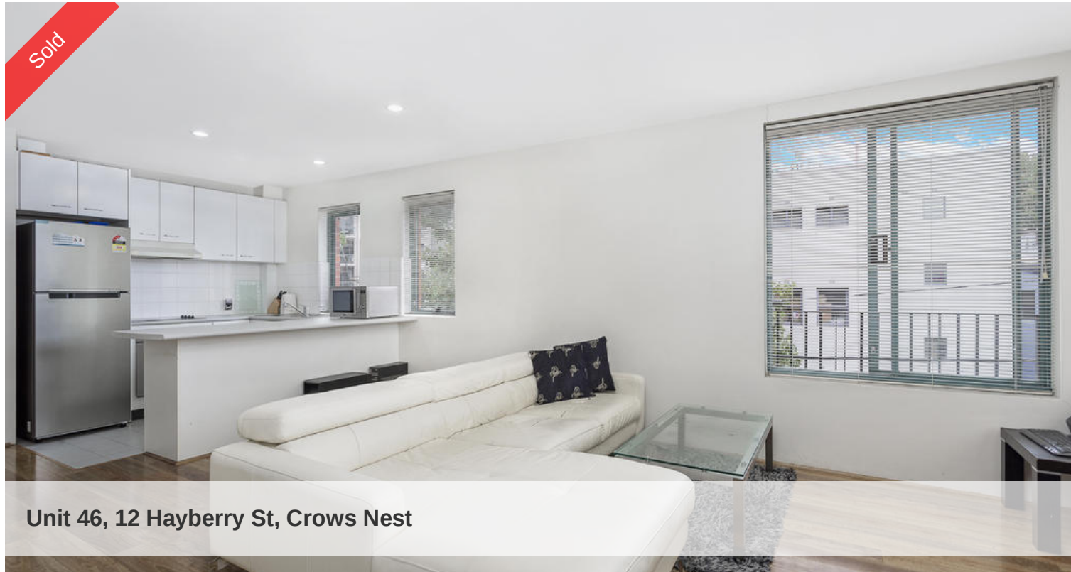
Unit 46, 12 Hayberry St, Crows Nest