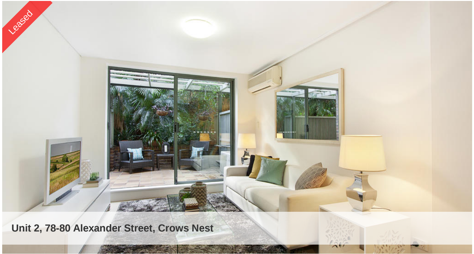
Unit 2, 78-80 Alexander Street, Crows Nest